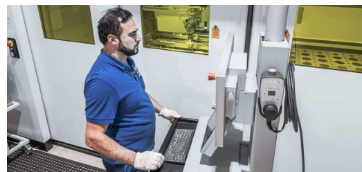
<p>With the help of the TruLaser Cell 7040 laser system with BrightLine